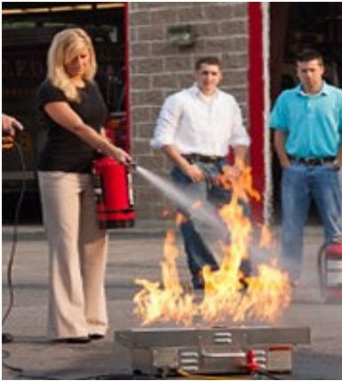
Practice with a controlled environment to build confidence.

East Dundee Fire District will come to your business or organization and teach your personnel the proper method of extinguishing a fire. The training is both safe and realistic.